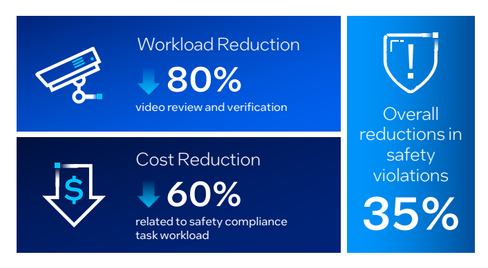
Figure 2. The bottling company reduced manual workloads by 80 percent and reduced the costs related to HSE compliance by 60 percent. Overall safety violations were reduced by 35 percent.<sup>3</sup>

Almost overnight, the bottling company witnessed enormous benefits that totally altered how it approached monitoring and inspection. It had an advanced solution in place that accommodated today's complex and highly automated requirements.